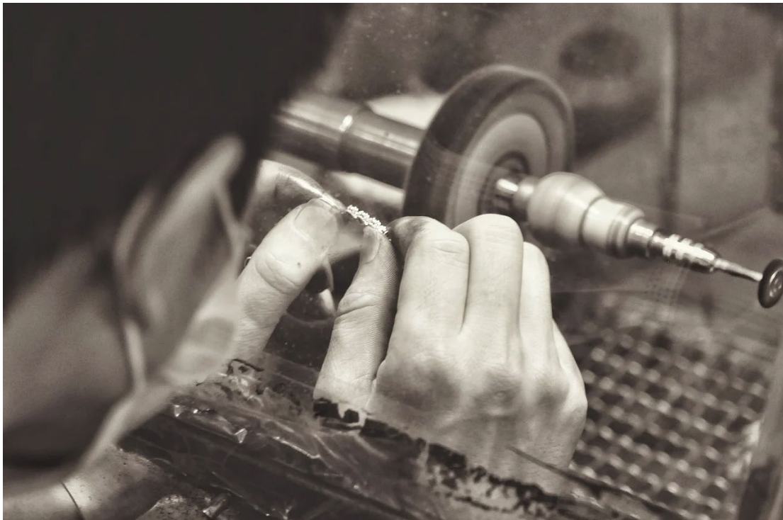
[karnbadjatia]. (2015). Jewelry manufacturing [Image]. Pixabay. https://pixabay.com/photos/jewelry-manufacturing-manufacturing-1381501/pixabay.com