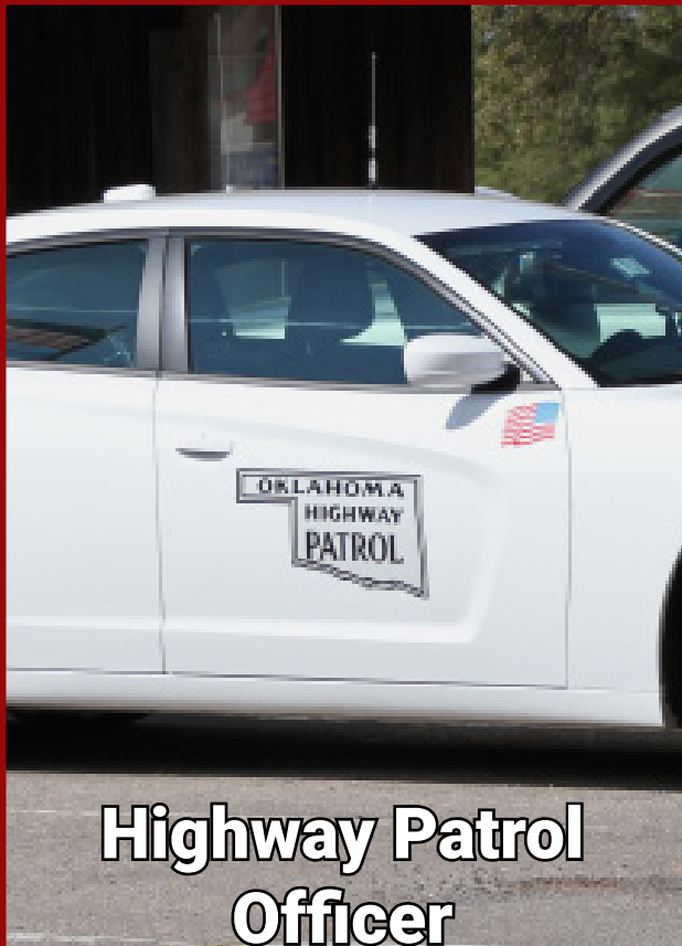
Highway Patrol Officer