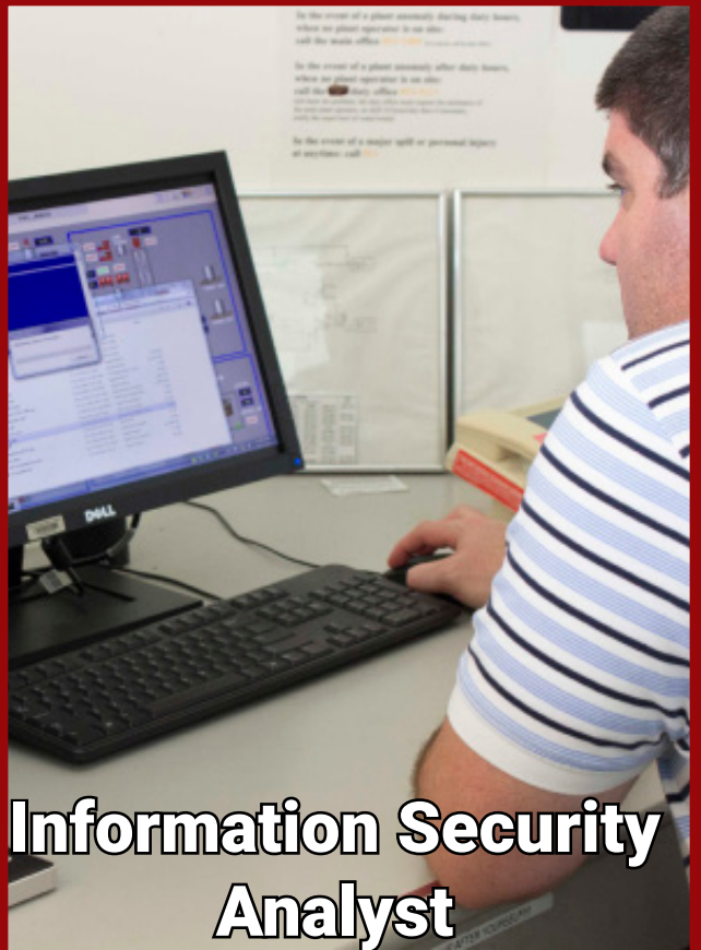
Information Security Analyst