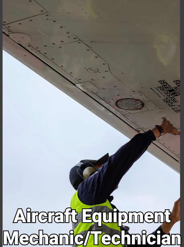
Aircraft Equipment Mechanic/Technician