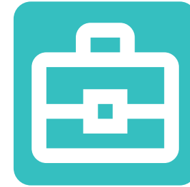
Business, Marketing & Management