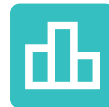
Business Management & Administration