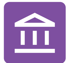
Government & Public Administration