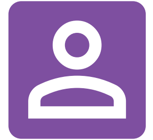
Human Services & Resources