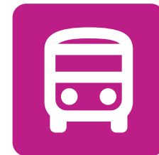
Transportation, Distribution, & Logistics