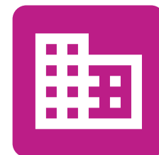
Architecture & Construction