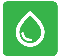
Agriculture, Food & Natural Resources