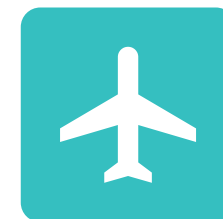
Hospitality & Tourism