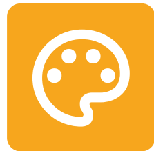
Arts, A/V Technology, & Communications