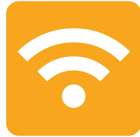
Communication & Information Systems