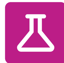
Science, Technology, Engineering & Mathematics

Each of the six career fields is divided into 1-4 sub-groups, called clusters. Each cluster is made up of a number of occupations and postsecondary majors related to the specialty of that cluster. The results of your OKCareerGuide interest and skills assessments are linked to these same clusters.