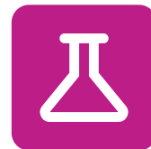
Science, Technology, Engineering & Mathematics