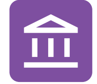
Government & Public Administration