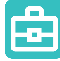
Business, Marketing & Management