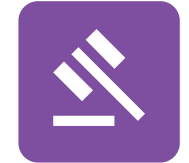
Law, Public Safety, Corrections & Security