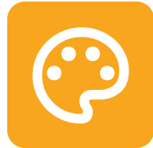
Arts, A/V Technology, & Communications