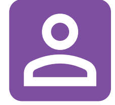
Human Services & Resources