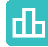
Business Management & Administration