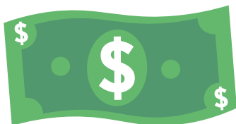
Tuition & Fees