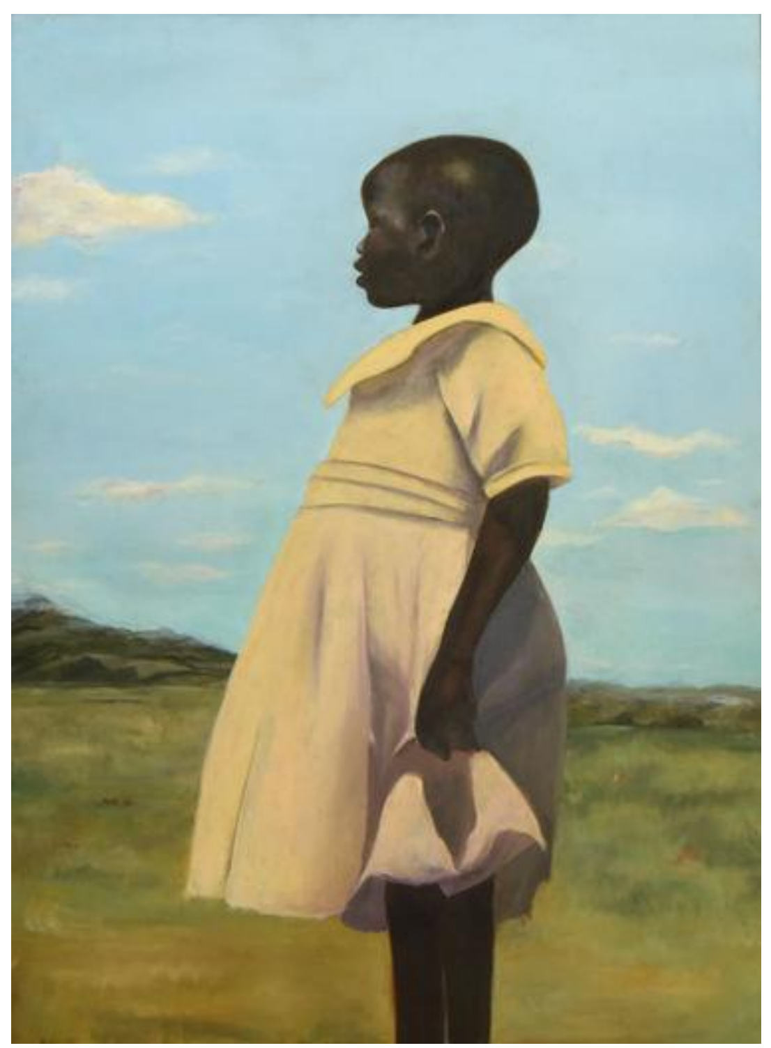
Forrester, C. (2015). Uganda [Painting]. The Metropolitan Museum of Art, New York, NY.