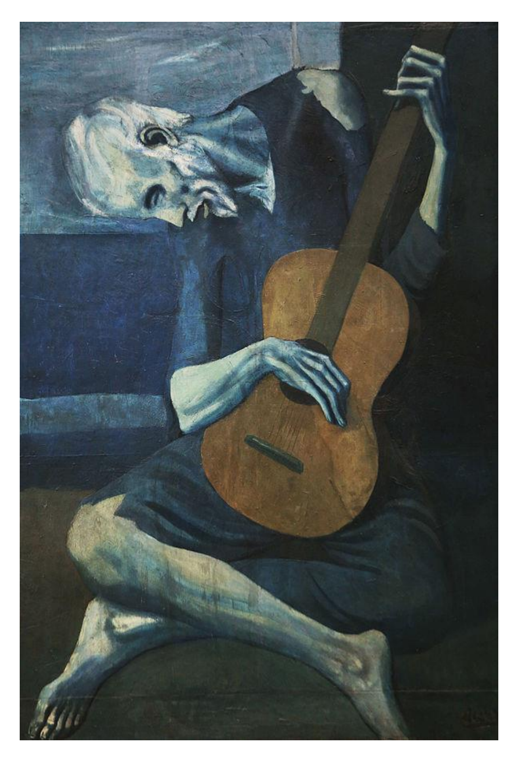
Picasso, P. (1903–1904). The old guitarist [Painting]. Art Institute of Chicago, Chicago, IL.