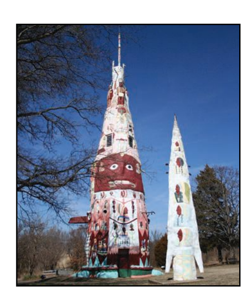
Totem Pole Park

For more information about Totem Pole Park, visit http:// www.nps.gov/nr/travel/route66/ galloways_totem_pole_park_foyil. html