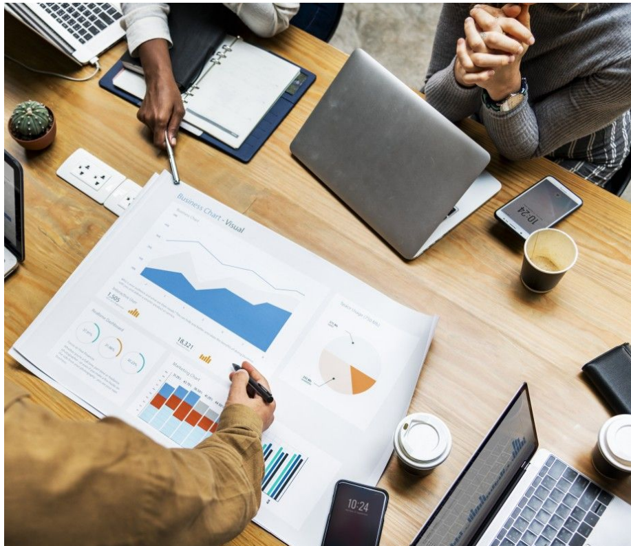
Rawpixel. (2018). Achievement. Pxhere. https://pxhere.com/en/photo/1450669