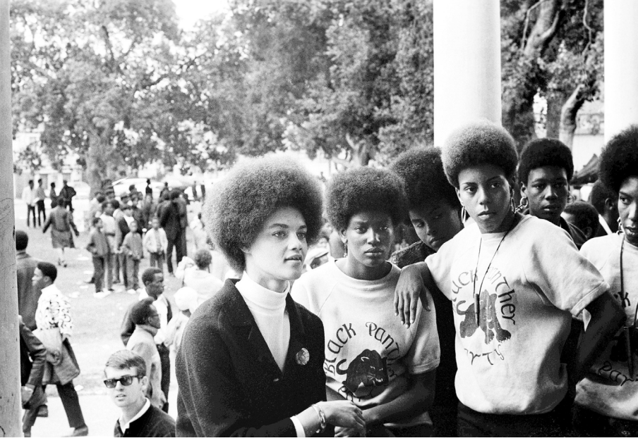
James, S. (2016, October 19). Panthers line up at a Free Huey rally [Photograph found in Steven Kasher Gallery, Oakland]. https://www.anothermag.com/fashion-beauty/9194/retracing-the-creative-legacy-of-the-black-panthers