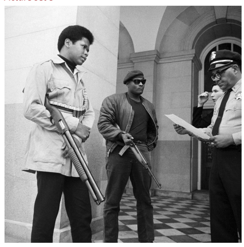
Morgan, T. (2018, August 30). The NRA supported gun control when the Black Panthers had the weapons. History.com . https://www.history.com/news/black-panthers-gun-control-nra-support-mulford-act