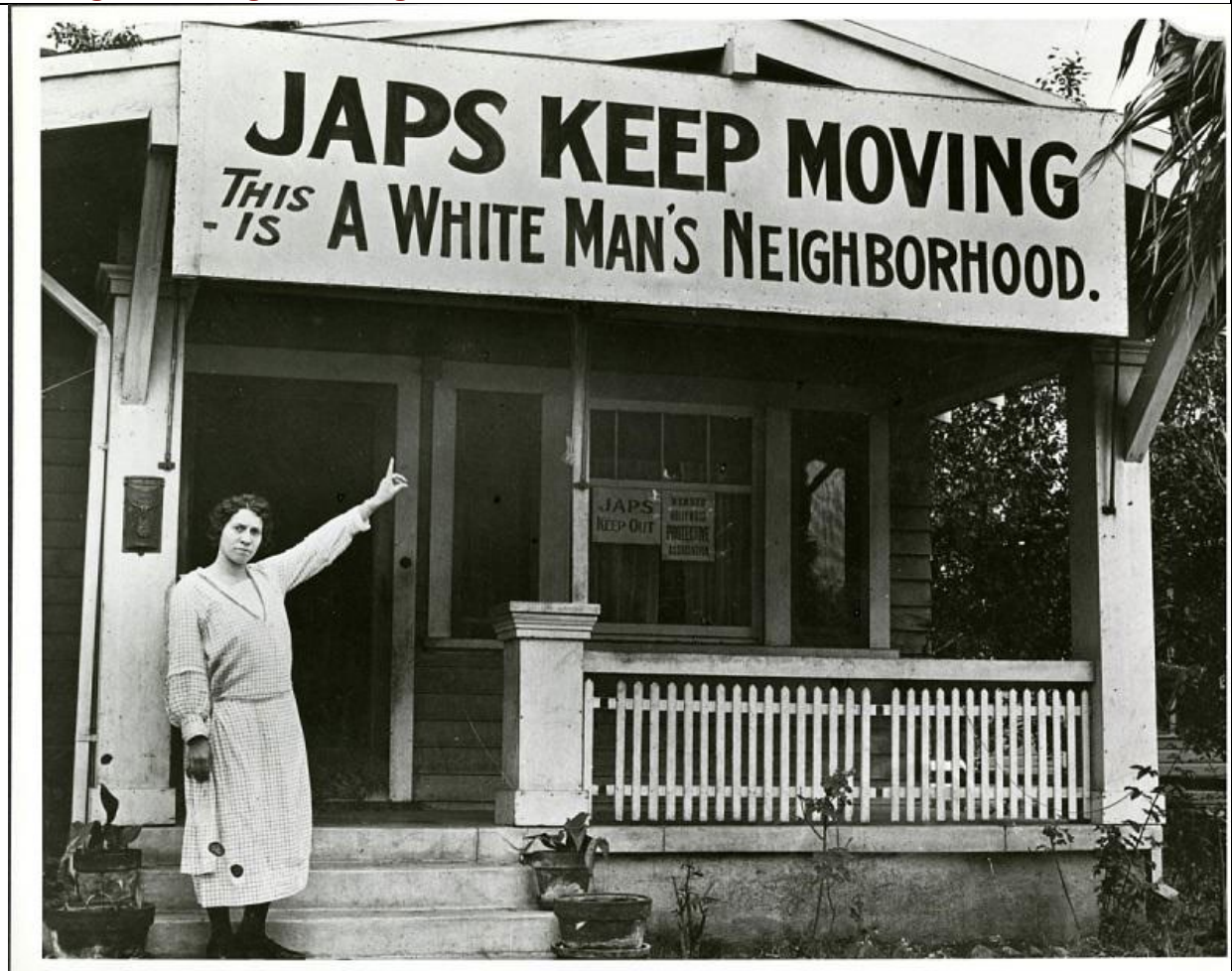
Image 1 - A resident of Hollywood, California, makes clear her sentiments to any Japanese looking for housing in her neighborhood, around 1923.

Source: National Japanese American Historical Society. (c. 1923). A resident of Hollywood, California, makes clear her sentiments to any Japanese looking for housing in her neighborhood, around 1923. Smithsonian Institution. https://americanhistory.si.edu/righting-wrong-japanese-americans-and-world-war-ii/racism