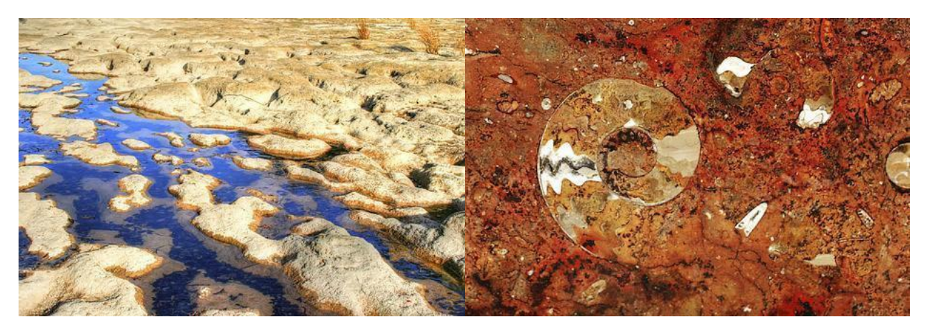
Left : Rivers carry calcium ions into the ocean, where they react with bicarbonate ions dissolved in the water. The product of that reaction, calcium carbonate, is then deposited on the ocean floor, where it becomes limestone.

atmosphere, carbon atoms—some of which are human emitted—combine with water to make carbonic acid that falls to the ground when it rains. The acid weathers (dissolves) rocks and releases calcium, magnesium, potassium, or sodium ions. In rivers and oceans, the calcium ions join with bicarbonate ions to form calcium carbonate (which you may have seen before—it is a dry, chalky white substance that can be found near faucets in areas with hard water). Calcium carbonate is also created when shell-building organisms, such as coral and plankton, die and sink to the ocean floor. As time passes, layers of those calcified shells and sediment are compressed to form rocks that store carbon. The same occurs with organisms on land, whose remains after death sometimes become buried in the soil and compressed into rock formations.