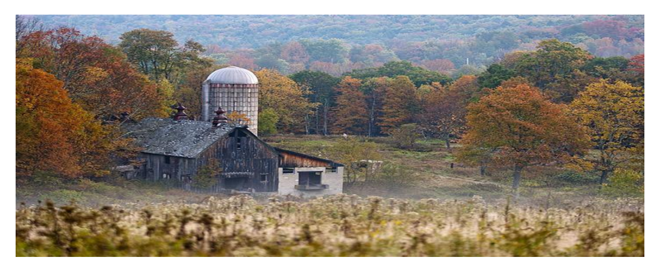
Changes in land cover—when forests are converted to fields and vice versa—have a corresponding effect on the carbon cycle. In some northern-hemisphere countries, many farms were abandoned in the early 20th century, and the land then reverted to forest. As a result, carbon was drawn out of the atmosphere and stored in trees on land.