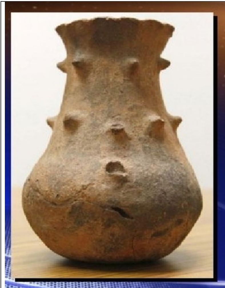
Artefacto #7: