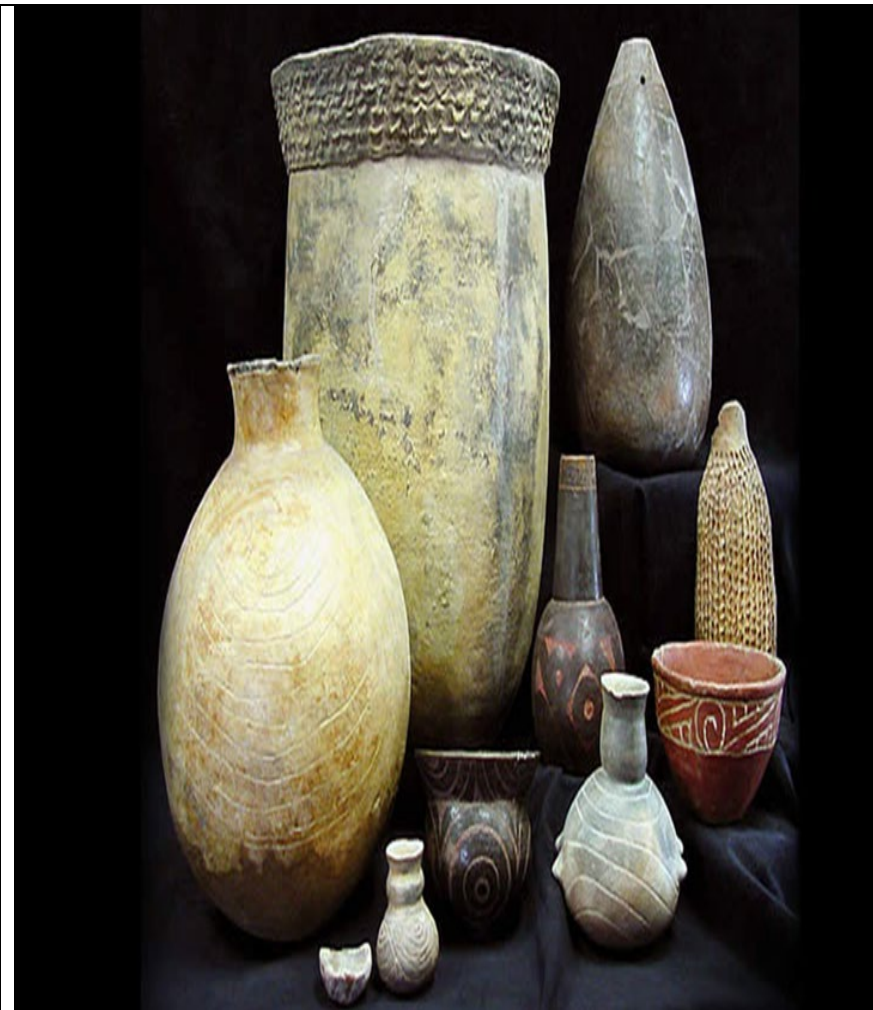
Artefacto #8: