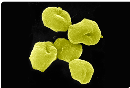
Unknown Organism C

"Puff up" when threatened Decays starts after 1 day Waste products found in medium Thousands of new organisms found each day Apparent cycle from infant-juvenile-adult phase