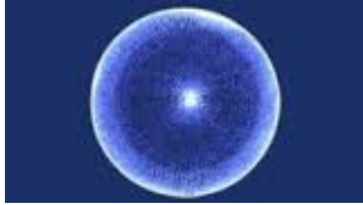
Unknown Organism B

Appears to Move toward food Appears to be Single celled Organism population doubles every day Circular Genetic structure Waste products in medium found