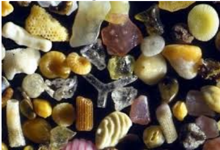
Unknown Organism E

Stationary Appears to be Single celled No appearance of reproduction (no new organisms) after 3 days No hereditary material found