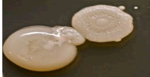
Unknown Organism D

No reaction when threatened Decay starts after 1 day No evidence of reproduction Waste products in medium found No life cycle apparent