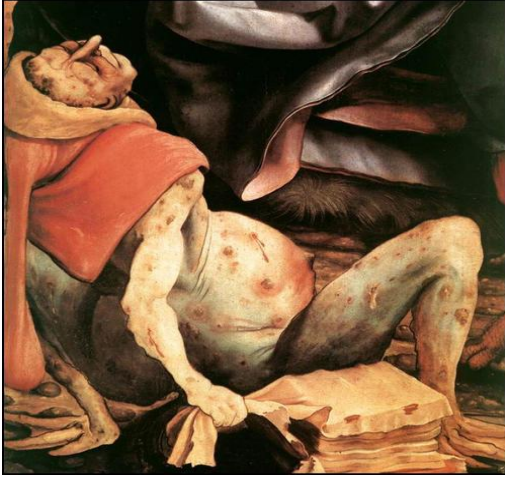
(Source 1) Matthias Grünewald, detail from The Temptation of St Anthony (c. 1512)

http://spartacus-educational.com/EXnormans10.htm