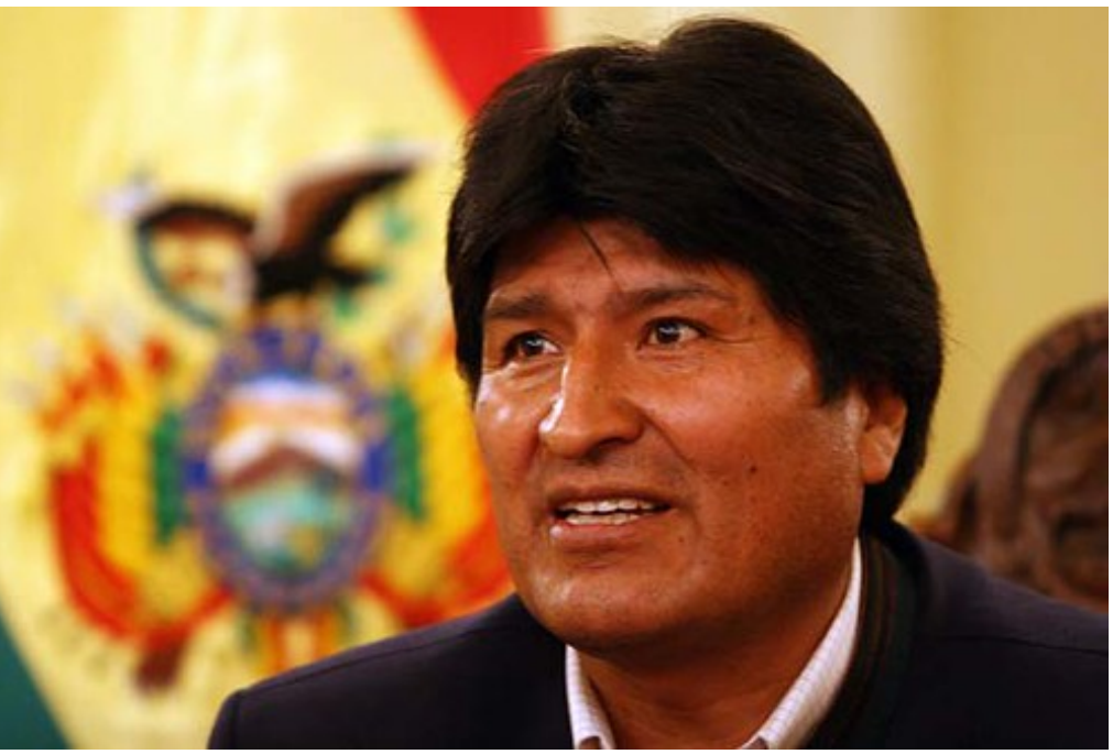
EVO MORALES PRESIDENT OF BOLIVIA

Evo Morales Quotes. (n.d.). Retrieved from https://www.brainyquote.com/quotes/evo_morales_482008?src=t_environmental