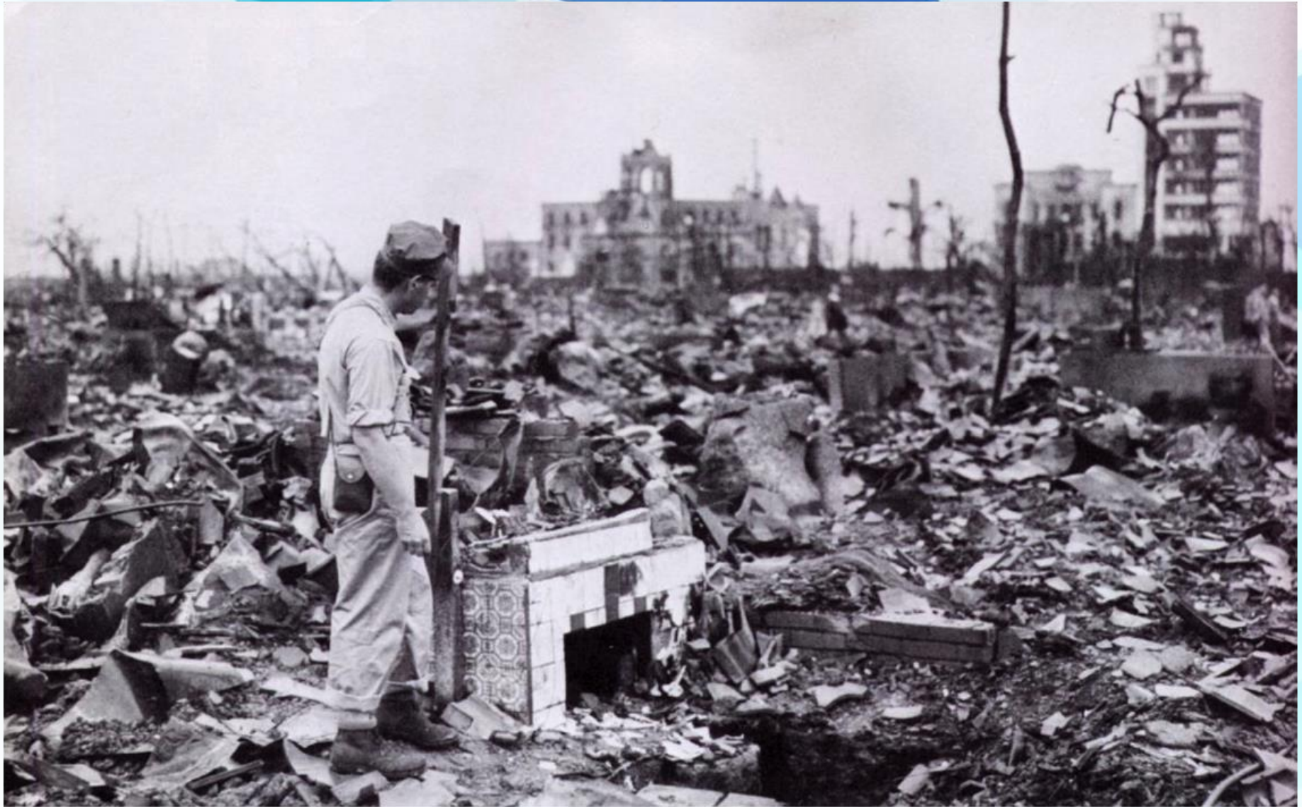
Witness to Destruction [photograph]. (1945).