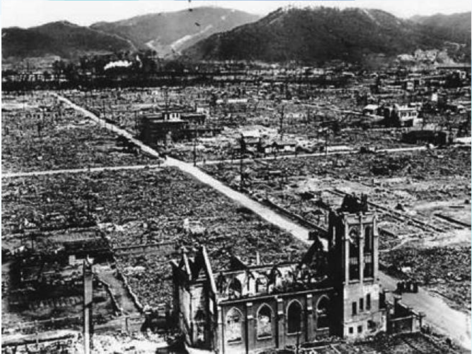
Hiroshima Church. (1945). [photograph]. Retrieved from http://www.neatorama.com/2012/02/27/the-unluckiest-train-ride/