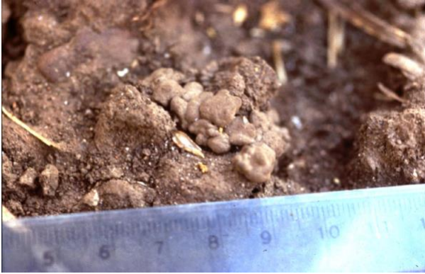
Casts at the soil surface are evidence that earthworms are shredding, mixing, and burying surface residue.