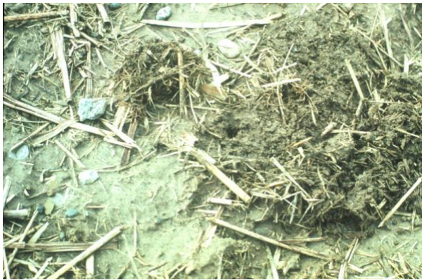
A mound of organic matter was moved aside to expose the entrance to a burrow. L. terrestris will quickly replug its burrow if its mound is removed.

Although there is much more to learn about how earthworms affect water movement through soil, they clearly help minimize pollution of surface waters by improving infiltration rates and decreasing runoff.