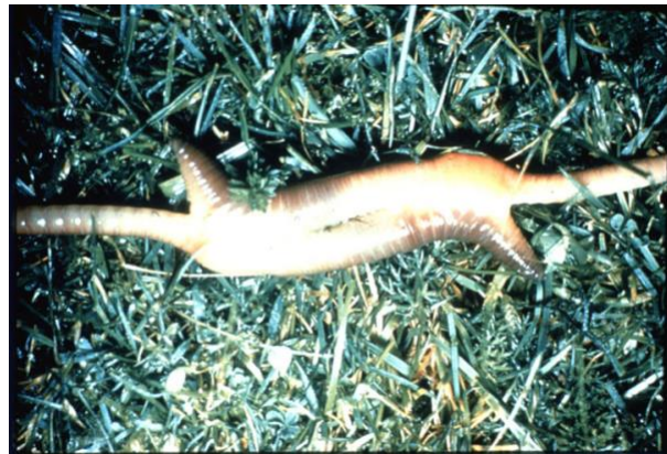
After the worms separate, they each produce a cocoon. One or two worms will hatch from a cocoon after several weeks. L. terrestris cocoons are about a quarter inch long.