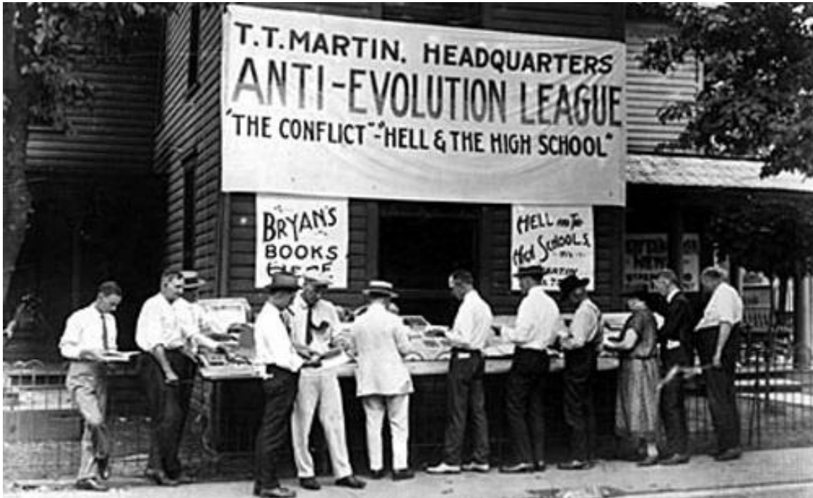
Anti-Evolution League, at the Scopes Trial, Dayton Tennessee from Literary Digest, July 25, 1925. Retrieved from https://commons.wikimedia.org/wiki/File:Anti-EvolutionLeague.jpg