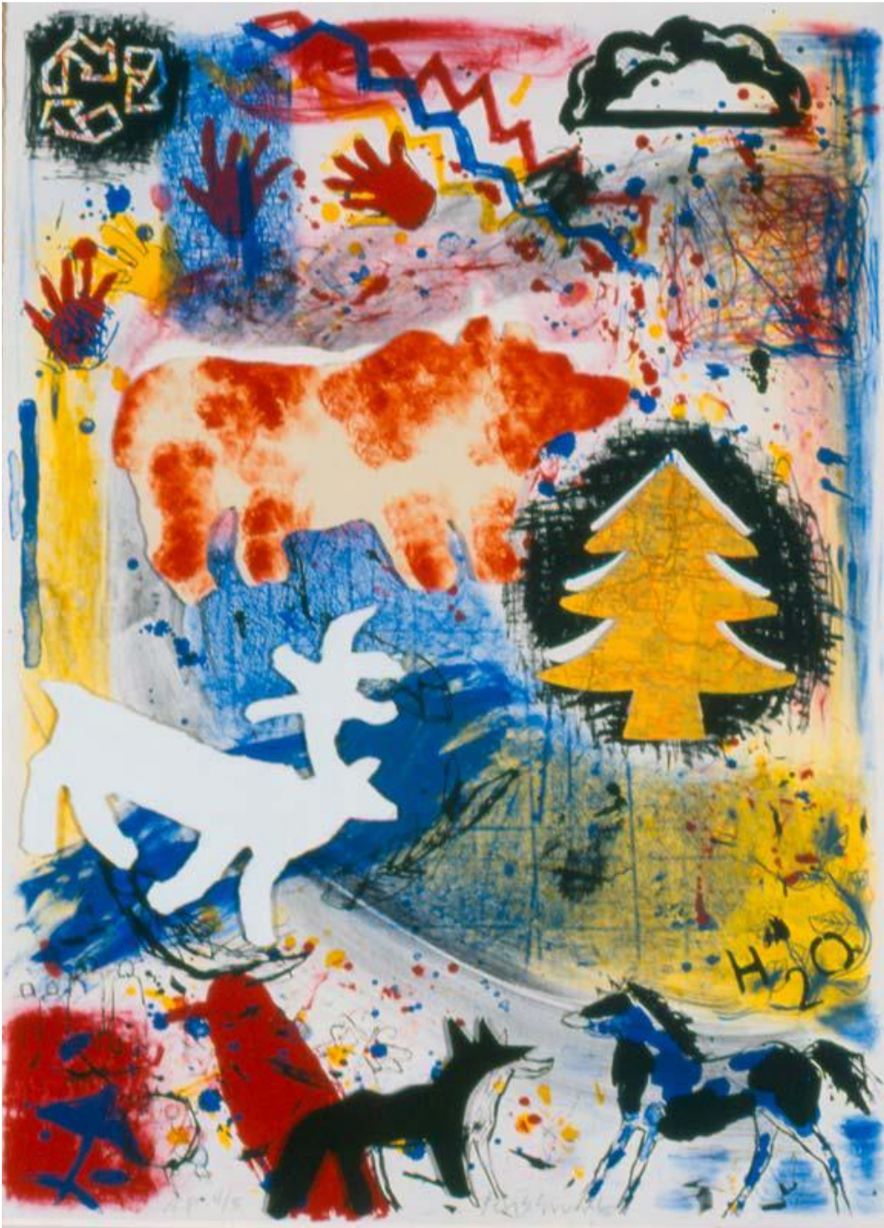
Ode to Chief Seattle, lithograph, ca. 1991, 30 x 22.25"

Smith, J. Q- t. S. (1991). Ode to Chief Seattle [Lithograph]. Missoula, MT: Missoula Art Museum. Retrieved from http://missoulaart.pastperfect-online.com/36919cgi/mweb.exe?request=record;id=FA68A456-6B46-4BEA-B1E7-164757597140;type=101