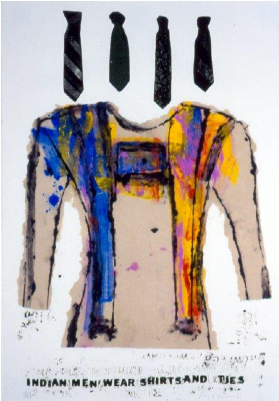
Indian Men Wear Shirts and Ties, lithograph, ca. 1997, "41.75 X 29.25"

Smith, J. Q. t. S. (1997). Indian men wear shirts and ties [Lithograph]. Missoula, MT: Missoula Art Museum. Retrieved from http://missoulaart.pastperfect-online.com/36919cgi/mweb.exe?request=record;id=61D97740-A703-4F36-AE45-971619371694;type=101