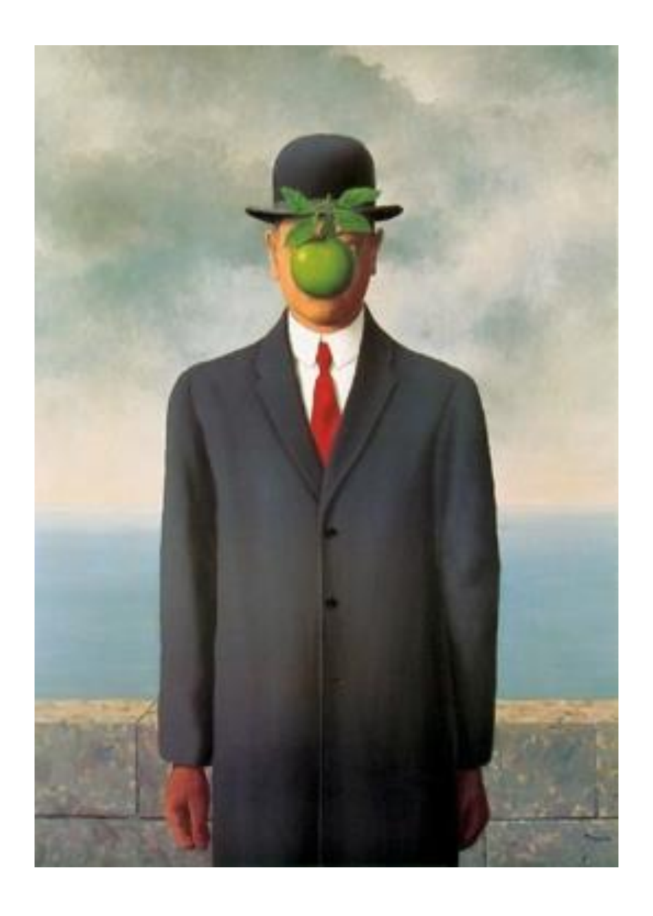
Magritte, R. (1964). The son of man [Painting].