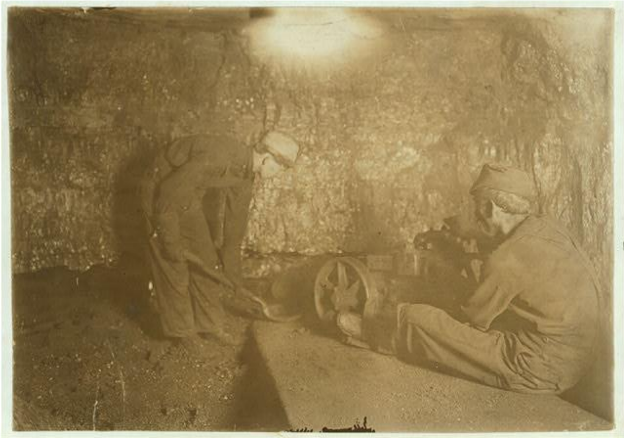
Man with punching machine [preparing] to drill into coal. Boy shovels out 10 [hours] daily. Red Star, West Virginia.

Library of Congress. (n.d.). National Child Labor Committee, No. 69. Man with punching machine to drill into coal. Boy shovels out 10 hrs. daily, Laura Mine, Red Star, W. Va. Location: Red Star, West Virginia.. Library of Congress Prints and Photographs Division Washington, D.C. 20540 USA. Retrieved from https://hdl.loc.gov/loc.pnp/nclc.01048