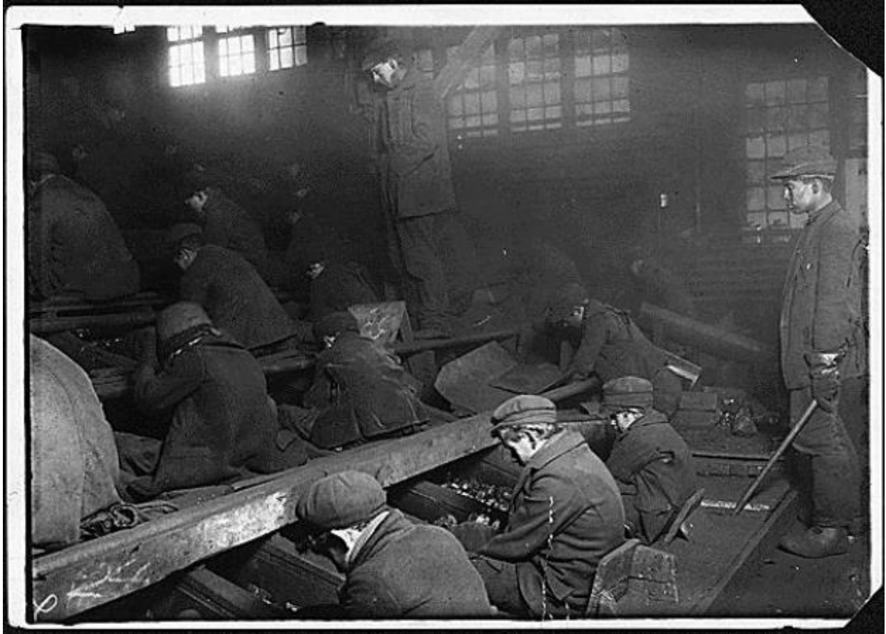
View of the Ewen Breaker of the Pa. Coal Co. The dust was so dense at times as to obscure the view. This dust penetrated the utmost recesses of the boys' lungs. A kind of slave-driver sometimes stands over the boys, prodding or kicking them into obedience. Pittston, Pennsylvania, 1911.

Hine, L. (1912.). View of the Ewen Breaker of the Pa. Coal Co. The dust was so dense at times as to obscure the view. This dust penetrated the utmost recesses of the boy's lungs. A kind of slave-driver sometimes stands over the boys, prodding or kicking them into obedience. S. Pittston, Pa.. National Archives Catalog. Retrieved from https://catalog.archives.gov/id/523378