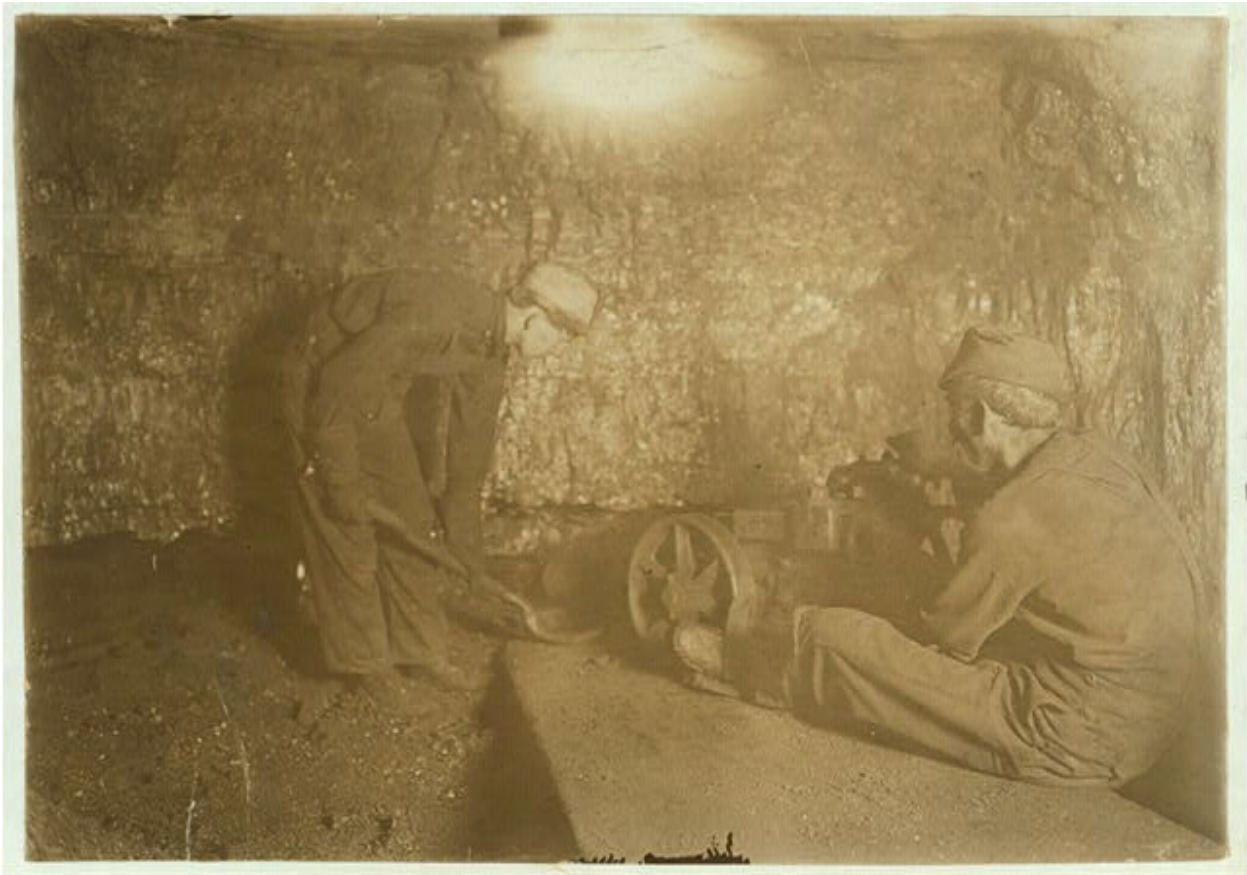
Man with punching machine [preparing] to drill into coal. Boy shovels out 10 [hours] daily. Red Star, West Virginia.

Library of Congress. (n.d.). National Child Labor Committee, No. 69. Man with punching machine to drill into coal. Boy shovels out 10 hrs. daily, Laura Mine, Red Star, W. Va. Location: Red Star, West Virginia.. Library of Congress Prints and Photographs Division Washington, D.C. 20540 USA. Retrieved from https://hdl.loc.gov/loc.pnp/nclc.01048