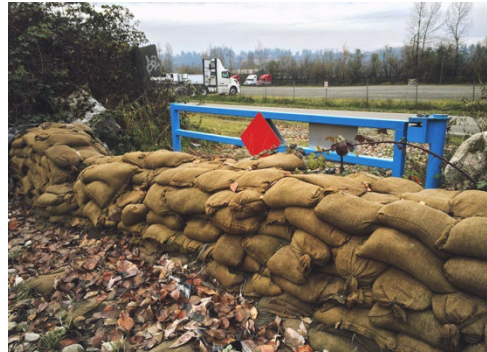
Pavlov, S. (2015, Nov. 30). Hessian sandbags [Image file]. Retrieved from https://commons.wikimedia.org/wiki/File:Hessian_sandbags_as_flood_protection.jpg