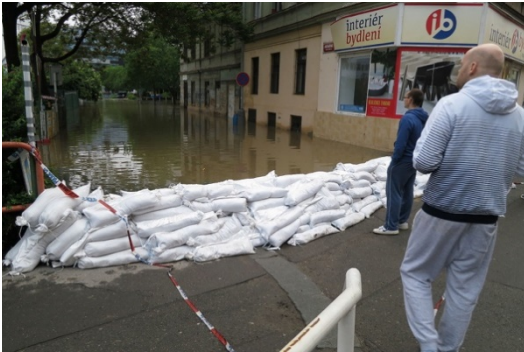
Sedláček, J. (2014, June 3). Flood in Prague 2013 [Image file]. Retrieved from https://commons.wikimedia.org/wiki/File:Flood_in_Prague_2013,_Ko%C5%BEelu%C5%BEsk%C3%A1_street_with_sand_bags.JPG