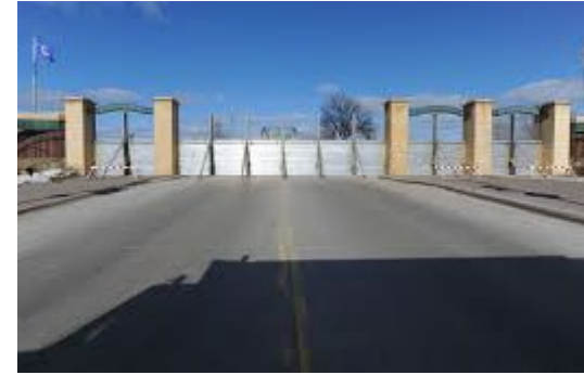
FEMA/Rieger, M. (2010, March 19). North Dakota flooding [Image file]. Retrieved from https://www.fema.gov/media-library/assets/images/56625