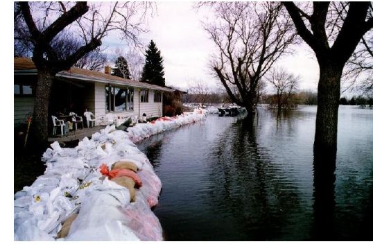
McCourt, M. (1997, April). Sandbags holding back flood waters from a neighborhood [Image file]. Retrieved from https://commons.wikimedia.org/wiki/File:Fargosan_dbagsflood1997.jpg