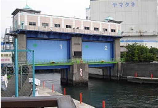
Jones, J. (2005, June 12). Oshimakawa Floodgate in Eitai 1-chome, Koto, Tokyo [Image file]. Retrieved from https://commons.wikimedia.org/wiki/File:Floodgate_Tokyo.jpg