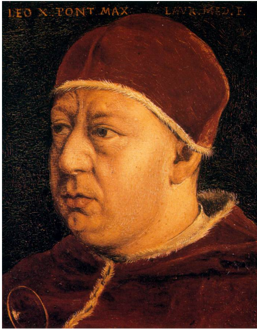
You are Pope Leo X

"I was the Pope of the Roman Catholic Church until my death in 1521. I am a member of the powerful de Medici family, and I am an active defender of the granting of indulgences. I refuse to acknowledge the demands listed in Martin Luther's Ninety-five Theses."