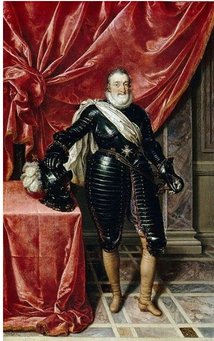
You are King Henry IV of France

"I am the King of France. I was baptized as a Catholic, but I was raised as a protestant (Huguenot). In order to keep my crown, I converted back to Catholicism, but I still supported protestant causes, such as the Edict of Nantes, where I granted religious freedom to Protestants."