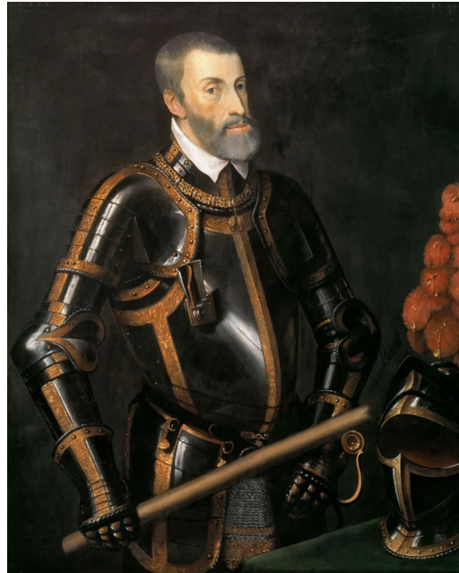
You are Holy Roman Emperor Charles V

"I am the Holy Roman Emperor, King of Spain, and Duke of Burgundy. I feel that it is my responsibility as the Holy Roman Emperor to defend the Empire from the Protestant Reformation. I worked with Pope Leo X to label Martin Luther as an outlaw at the Diet of Worms."