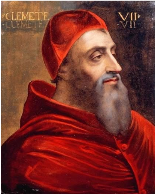
You are Pope Clement VII

"I am the Pope of the Roman Catholic Church after the death of my predecessor, Pope Leo X, and I inherited the power struggle of the Protestant Reformation. I am a member of the powerful de Medici family. I refused King Henry VIII's request for an annulment, which led to the English Reformation."