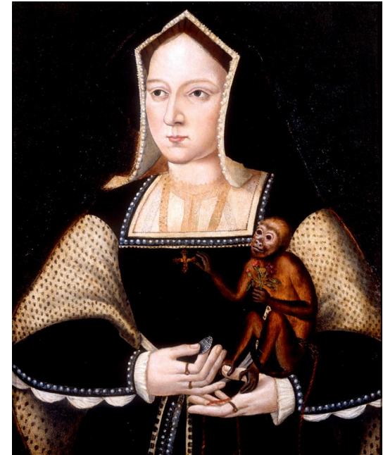
You are Catherine of Aragon

"I am the Queen of England, and I am married to King Henry VIII. I am a devout Roman Catholic, and my husband wants our marriage annulled, which is against the beliefs of my church. This caused King Henry VIII to break away and form the Church of England, which caused the English Reformation."