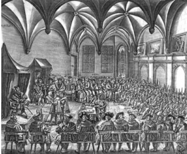
Figure 4: The Peace of Augsburg.