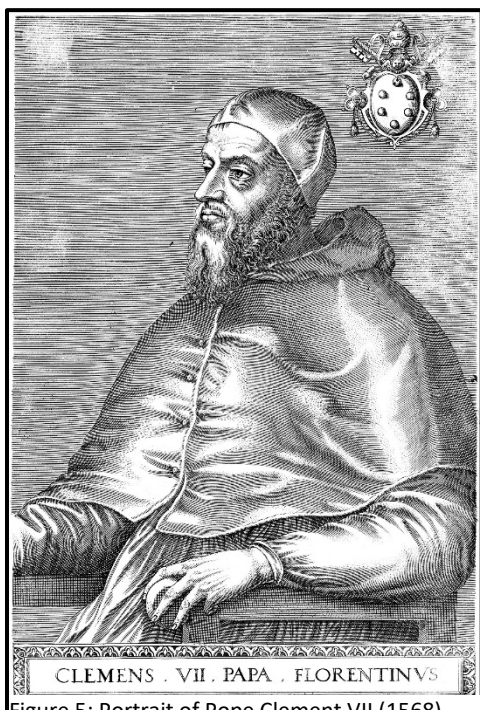
Figure 5: Portrait of Pope Clement VII (1568)

Pope Clement VII came to the Roman papacy at a time of great religious and political change in Europe. He served as head of the Catholic Church and ruler of the Papal States from 1523-1534. Born in Florence, most historians write of Pope Clement VII as a morally decent man, yet an indecisive pope. Inadvertently a major influence in the Protestant Reformation, Clement was caught in the political warring of two kings, each of whom asked him to take their side in control of Europe—Holy Roman Emperor Charles V (Archduke of Austria and King of Spain), and Francis I, (King of France). Clement struggled with political, military, and religious conflicts throughout his time as Pope. He dedicated himself to making peace among the different Christian leaders. Although a religiously devout man, Clement occupied much of his time supporting and engaged in art and science. He commissioned some of the most famous artwork of the age, including Michelangelo's "The Last Judgment" in the Sistine Chapel. He approved Nicolaus Copernicus' theory that the Earth revolved around the sun. He protected the Jews from the Inquisition. Although Clement was considered a diplomat, his detractors believed his interest in cultural and worldly things made him indifferent to the dangers of the Protestant Reformation.