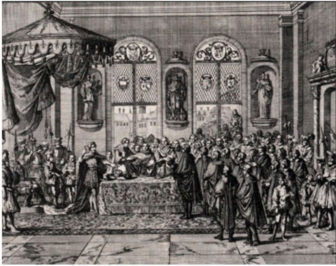
Figure 3: Registration of the Edict of Nantes by the Parliament of Paris

The edict also addressed Catholic concerns. The Catholic character of the crown and the kingdom