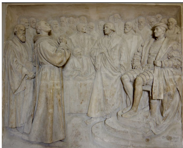
Figure 2: Luther at Worms