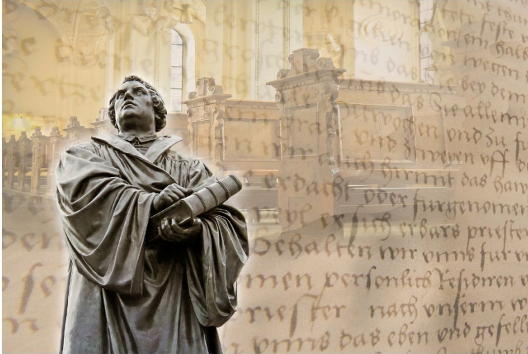
Figure 1: Martin Luther