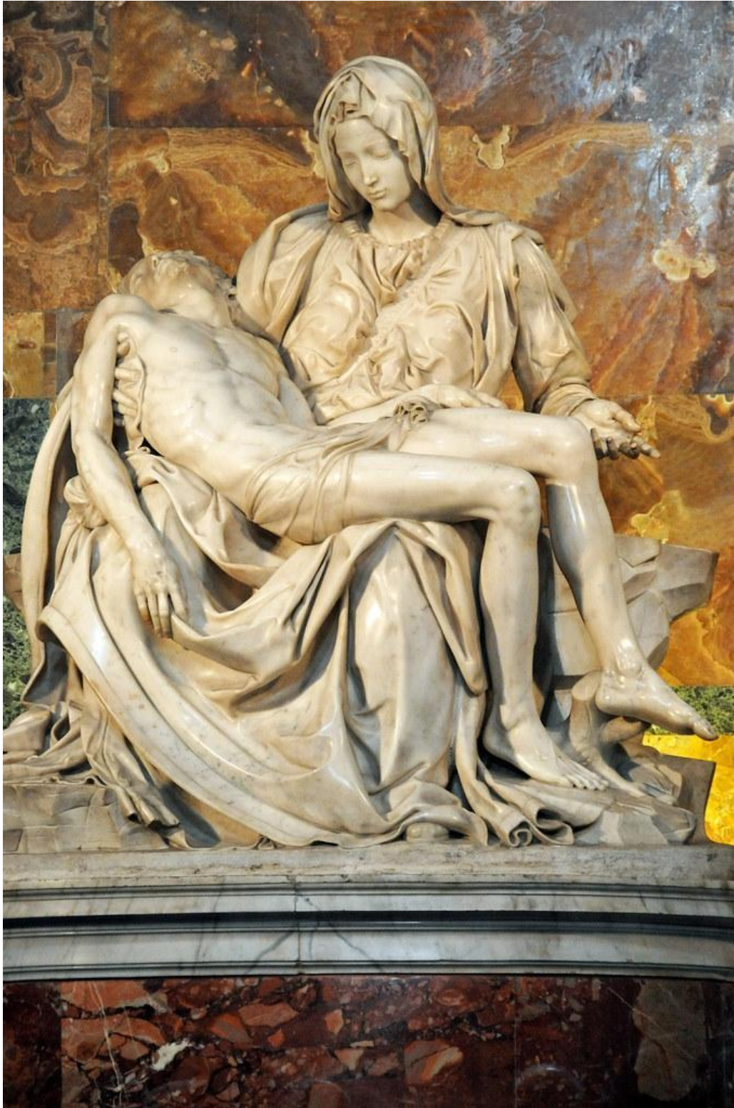
Miguel Ángel. (1498-1499). Pietà [estatua].

https://commons.wikimedia.org/wiki/File:Michelangelo%27s_Piet%C3%A0,_St_Peter%27s_Basilica_(1498%E2%80%931499).jpg