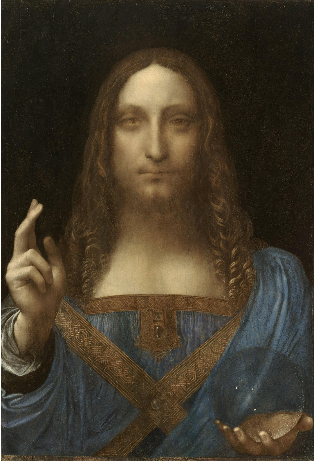
da Vinci, L. (ca. 1500). Salvator Mundi [Painting: Oil on walnut wood]. Wikimedia Commons.

https://commons.wikimedia.org/wiki/File:Leonardo_da_Vinci,_Salvator_Mundi,_c.1500,_oil_on_walnut,_45.4_%C3%97_65.6_cm.jpg