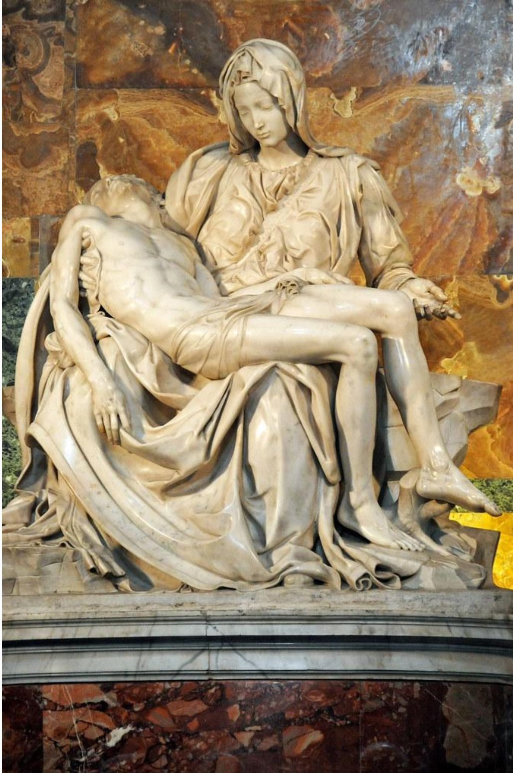
Michelangelo. (1498-1499). Pietà [Statue].

https://commons.wikimedia.org/wiki/File:Michelangelo%27s_Piet%C3%A0,_St_Peter%27s_Basilica_(1498%E2%80%939399).jpg