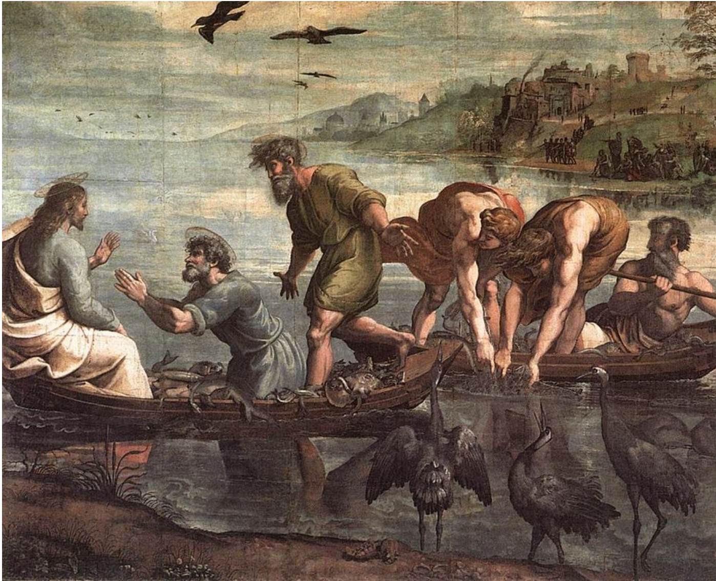
Raphael. (1515). The miraculous draught of fishes [Painting]. Wikimedia Commons. https://commons.wikimedia.org/wiki/File:V%26A_-_Raphael,_The_Miraculous_Draught_of_Fishes_(1515).jpg