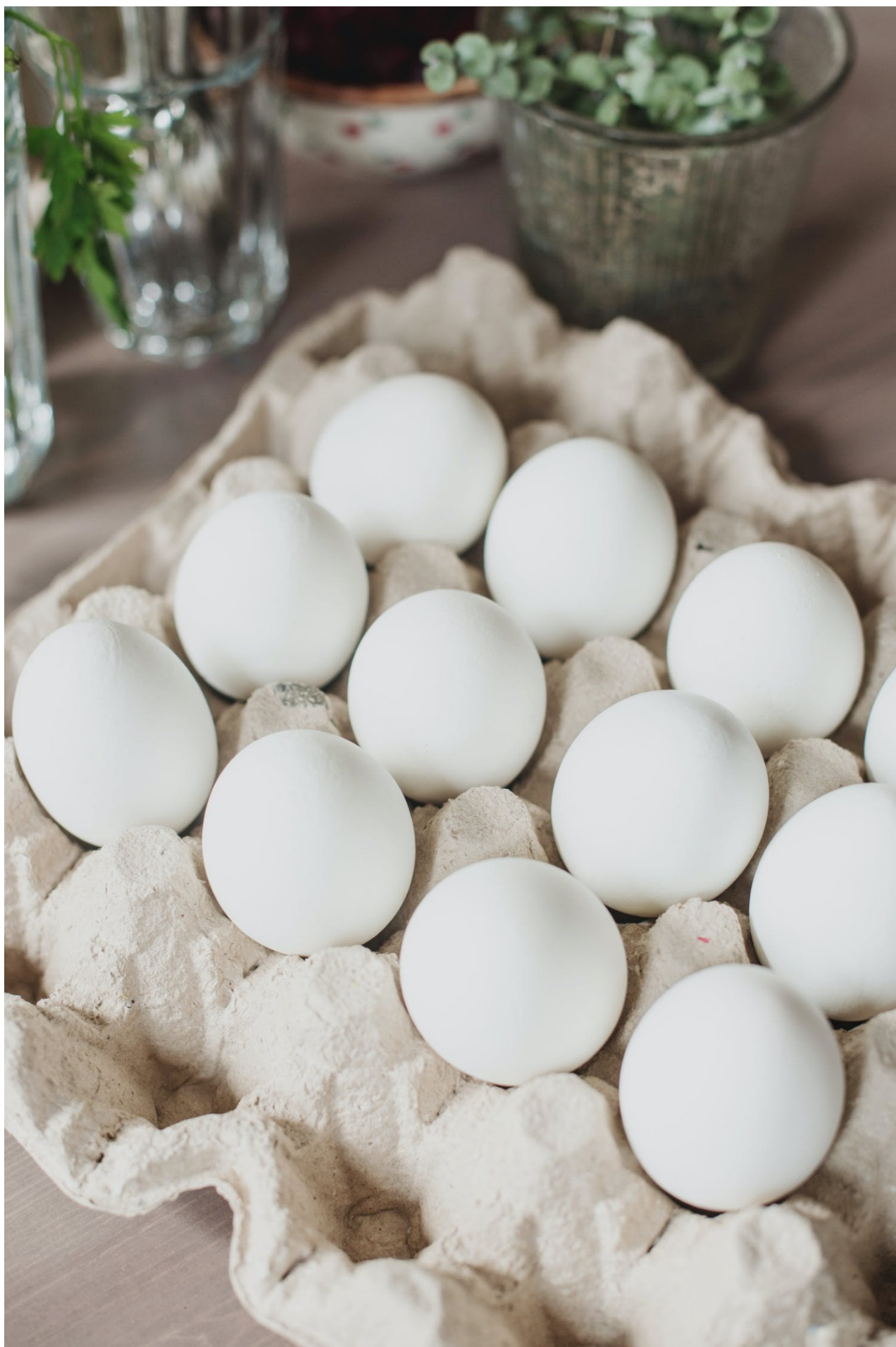
Chernaya, Ksenia. (2020). White eggs on brown tray. Pexels. https://www.pexels.com/photo/white-eggs-on-brown-tray-3980617/