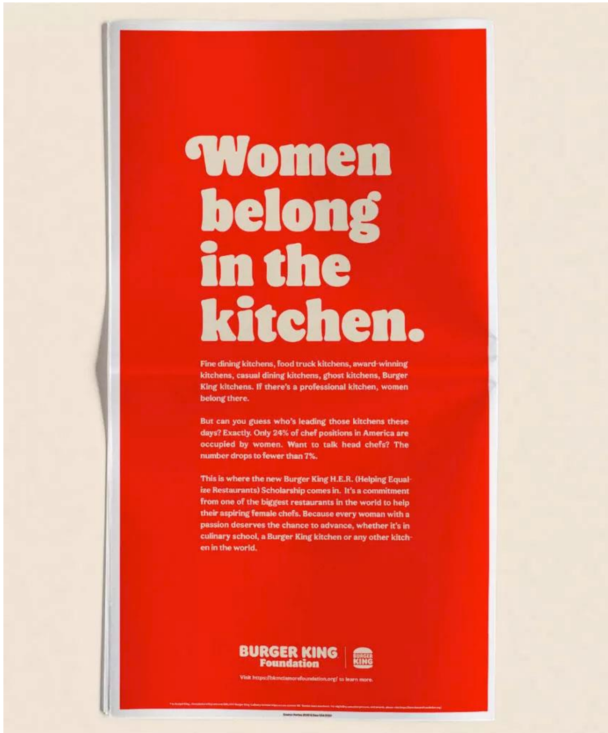
Burger King gets it all wrong FOR #IWD2021. (2021, March 09). Retrieved April 15, 2021, from https://wersm.com/burger-king-gets-it-all-wrong-for-international-womens-day/

Below is the marketing campaign Burger King released promoting their new scholarship during 2021's International Women's Day along with a tweet stating the same tagline.