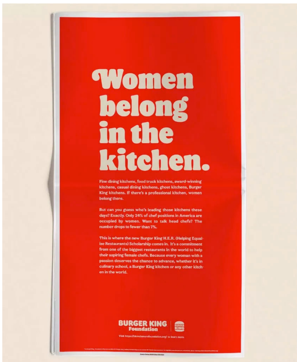
Burger King gets it all wrong FOR #IWD2021. (2021, March 09). Retrieved April 15, 2021, from https://wersm.com/burger-king-gets-it-all-wrong-for-international-womens-day/

After an uproar from the public, the campaign was halted and the original tweet was deleted. Below is an image of the tweet before it was taken down, along with follow-up tweets explaining the scholarship and the inequality of women in chef positions.