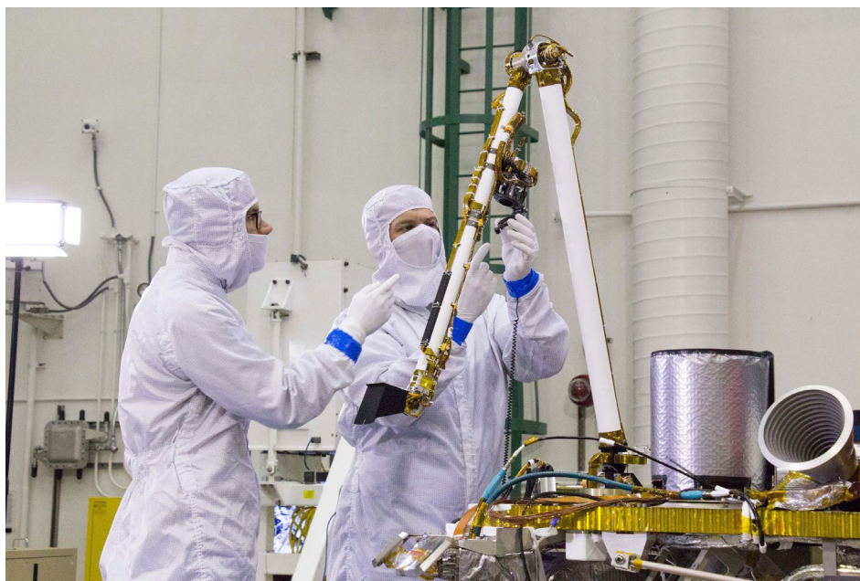
(n.d.). Pre-launch testing of InSight's robotic arm. NASA. https://www.jpl.nasa.gov/spaceimages/details.php?id=PIA22741

Did you know that chemical engineering isn't the only specialty in the Science, Technology, Engineering, and Math (STEM) cluster? Check out the careers classified as Professional, Science, and Technical , and those classified as Manufacturing to see all the STEM-based career options in this cluster!