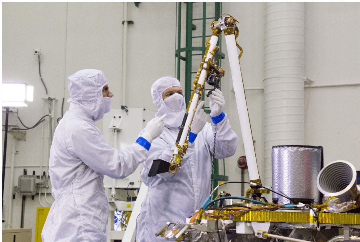
Pre-launch testing of InSight's robotic arm. NASA. https://www.jpl.nasa.gov/spaceimages/details.php?id=PIA22741

Did you know that chemical engineering isn't the only specialty in the Science, Technology, Engineering, and Math (STEM) cluster? Check out the careers classified as Professional, Science, and Technical , and those classified as Manufacturing to see all the STEM-based career options in this cluster!