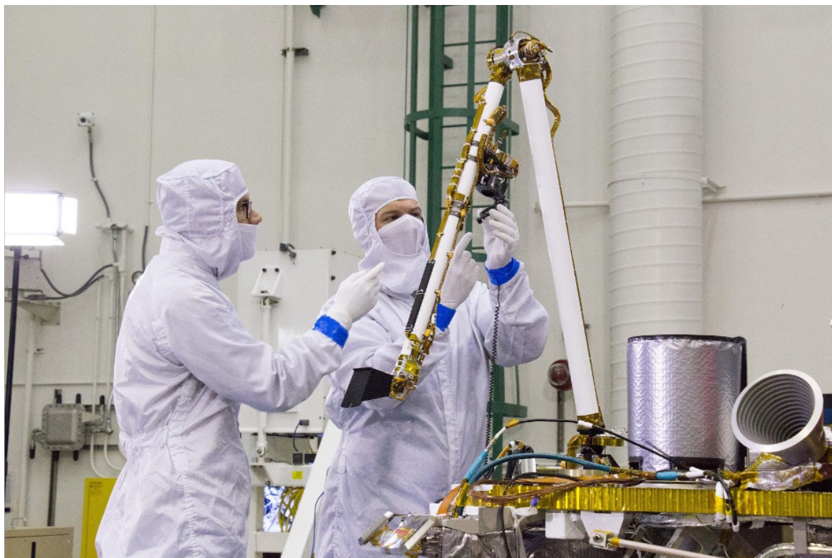
(n.d.). Pre-launch testing of InSight's robotic arm. NASA. https://www.jpl.nasa.gov/spaceimages/details.php?id=PIA22741

Did you know that chemical engineering isn't the only specialty in the Science, Technology, Engineering, and Math (STEM) cluster? Check out the careers classified as Professional, Science, and Technical , and those classified as Manufacturing to see all the STEM-based career options in this cluster!