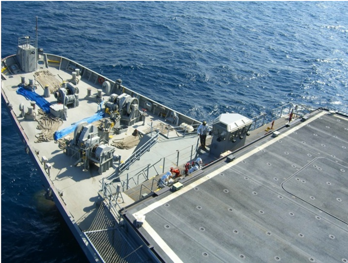
Link, L. (2006). Helicopter landing zone safety certification [Photograph].