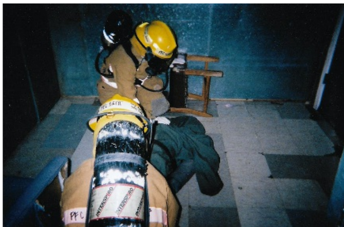
Link, L. (2004). Zero visibility victim rescue during a structure fire [Photograph].