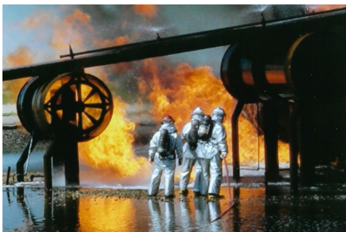
Link, L. (2004). C-130 jet fuel training fire [Photograph].

Firefighting is just one option on the Emergency and Fire Management career pathway. This pathway includes all workers who are involved in public safety and who contribute to rapid responses to fires and emergency situations, including natural disasters, accidents, medical emergencies, house fires, aircraft fires, and much more. Firefighting also falls under the larger Career Cluster of Law, Public Safety, and Security. Regardless of the situation, a firefighter's job is first and foremost about saving lives. To make this happen, firefighters are highly skilled and technically trained individuals who learn how to prevent the spread of and extinguish damaging fires in buildings. Specialized training is also available for wildland firefighting, aircraft firefighting, aerial firefighting, proximity firefighting, shipboard firefighting, and maritime (sea, ocean) firefighting.