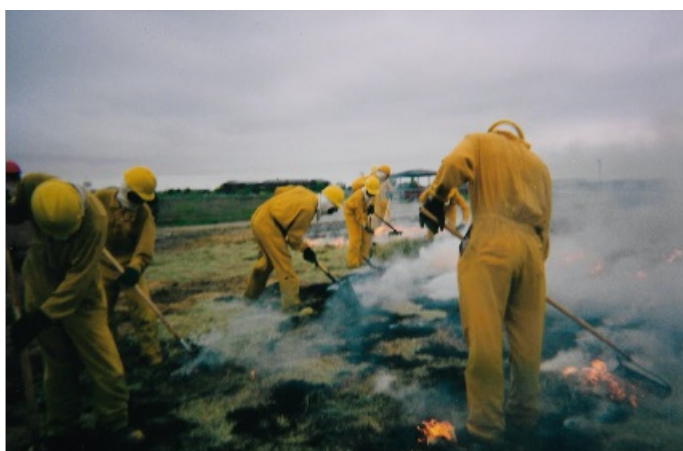
Link, L. (2004). Wildland training fire [Photograph].

Fighting a wildland fire requires a unique set of strategies. Often, the firefighters are volunteers and work with aerial firefighting aircraft.